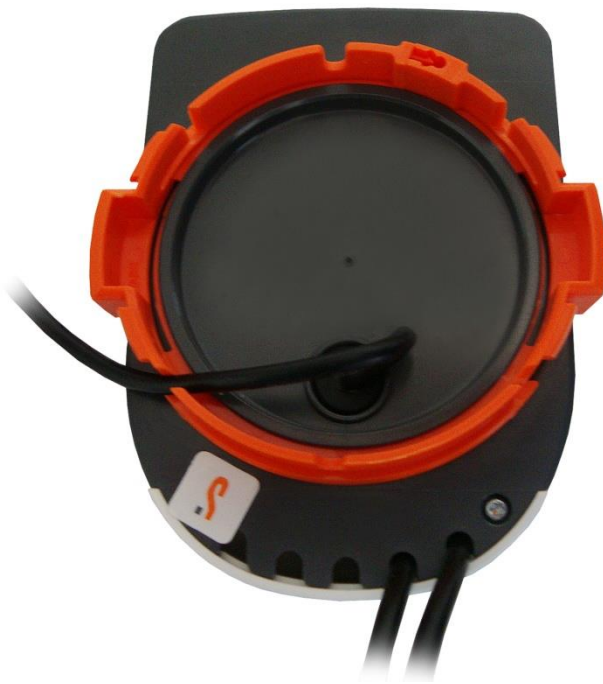
Figure 7 – Securing of the calculator by means of a sticker