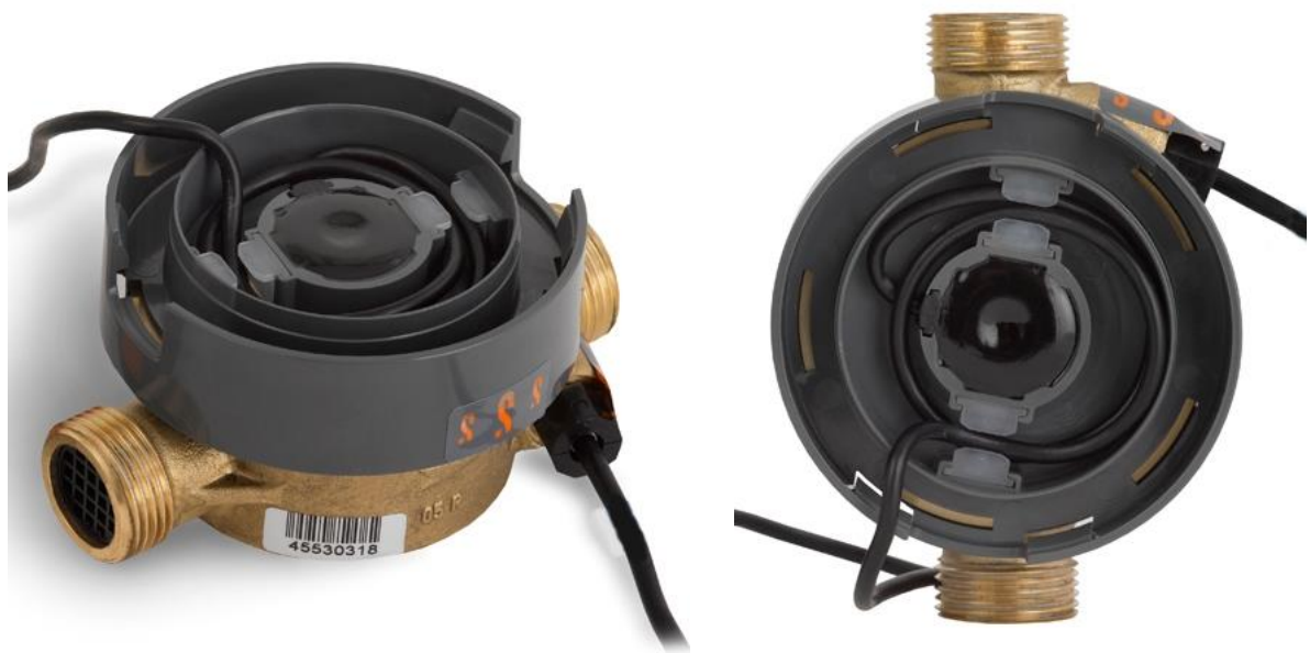
Figure 4 – Flow sensor (single-jet meter) and temperature sensors are sealed by means of stickers