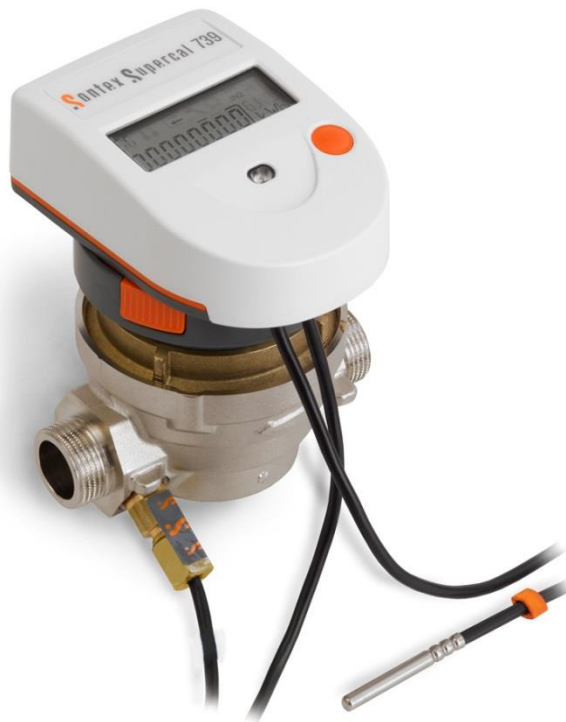
Figure 3 – Compact heat meter SUPERCAL 739, multi-jet measurement capsule meter for connection parts with M77x1.5 thread