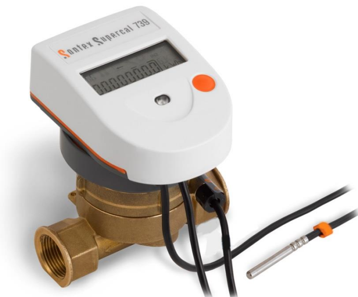
Figure 2 – Compact heat meter SUPERCAL 739, multi-jet measurement capsule meter for connection parts with G 2" thread