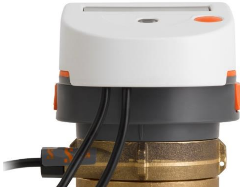
Figure 5 – Flow sensor (multi-jet measurement capsule meter) can't be removed non-destructively and the temperature sensors are sealed by stickers