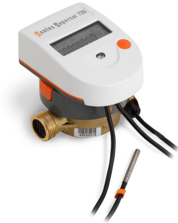
Figure 1 – Compact heat meter SUPERCAL 739, single-jet meter