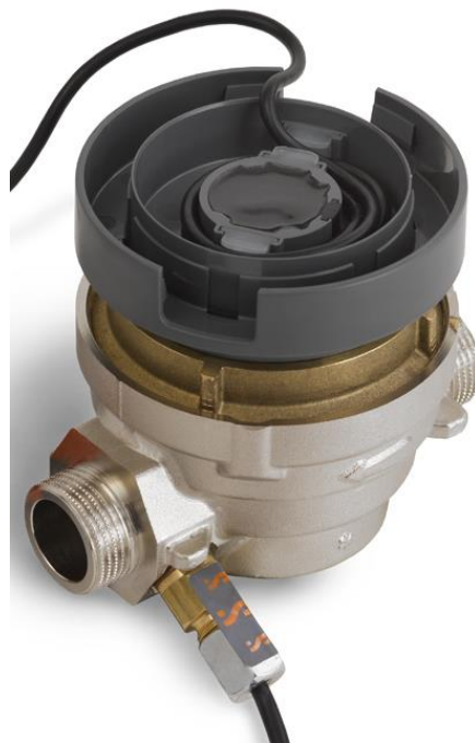
Figure 6 – Flow sensor (multi-jet measurement capsule meter) can't be removed non-destructively and the temperature sensors are sealed by stickers